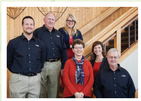
J. J. Keller Foundation Board of Directors and staff