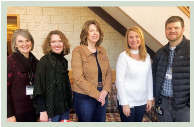
J. J. Keller and Oshkosh Truck Human Resource professionals work alongside staff from Rawhide Youth Services

One beneficiary of this project was Rawhide Youth Services, which serves at-risk youth and families in Wisconsin. To meet a labor-intensive accreditation process, Rawhide needed skilled human resources talent to help them update over 100 position descriptions. Four seasoned human resources professionals volunteered – three from J. J. Keller & Associates, Inc. and one from Oshkosh Corporation. The project was completed in less than three days. As a result, the new accreditation has led to growth opportunities for Rawhide Youth Services.